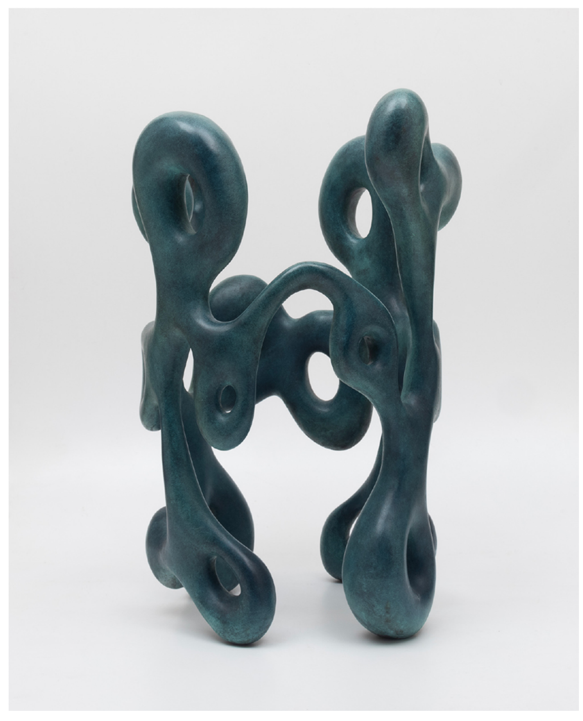
© Roberto Vivo. The Human Tribe Totem. Bronze Sculpture, 77 X 95 inches.

Coral Gallery's presentation of Roberto Vivo at the LA Art Show 2025 offers visitors an opportunity to engage with contemporary Latin American sculpture that addresses themes of human connection and global understanding.