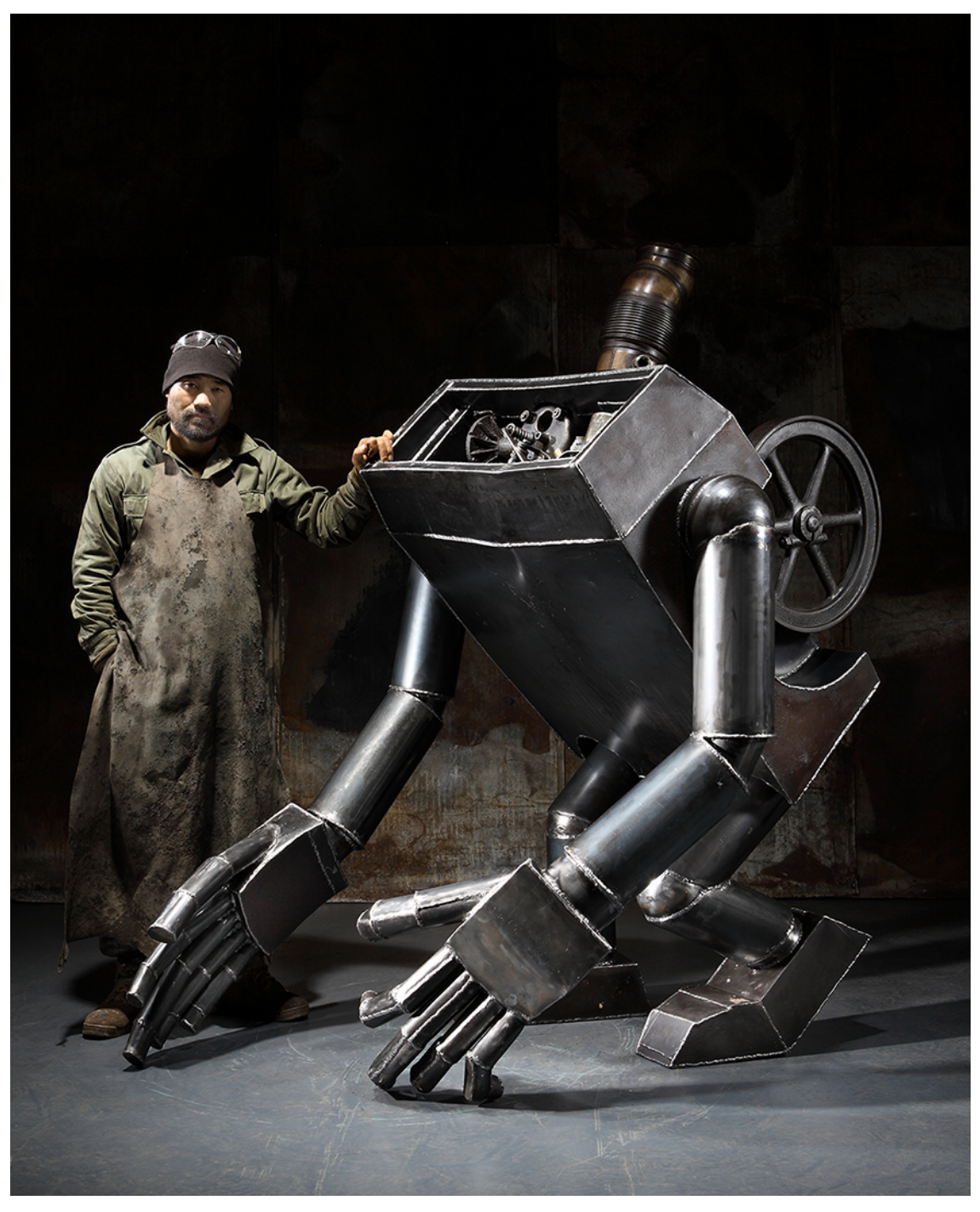
© Steel Che (Youngkwan Choi) with 'Steam Robot'. Carbon steel, 47 \times 47 \times 71 inches.

Art in Dongsan's presentation of Steel Che at the LA Art Show 2025 offers visitors a unique opportunity to experience the intersection of industrial heritage and contemporary sculpture, showcasing the evolving landscape of Korean art.