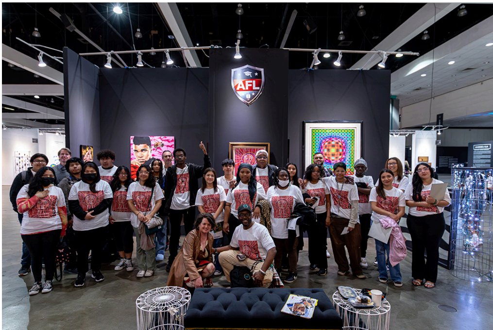
Above photos: Athletes for Life™ at the 2024 LA Art Show.