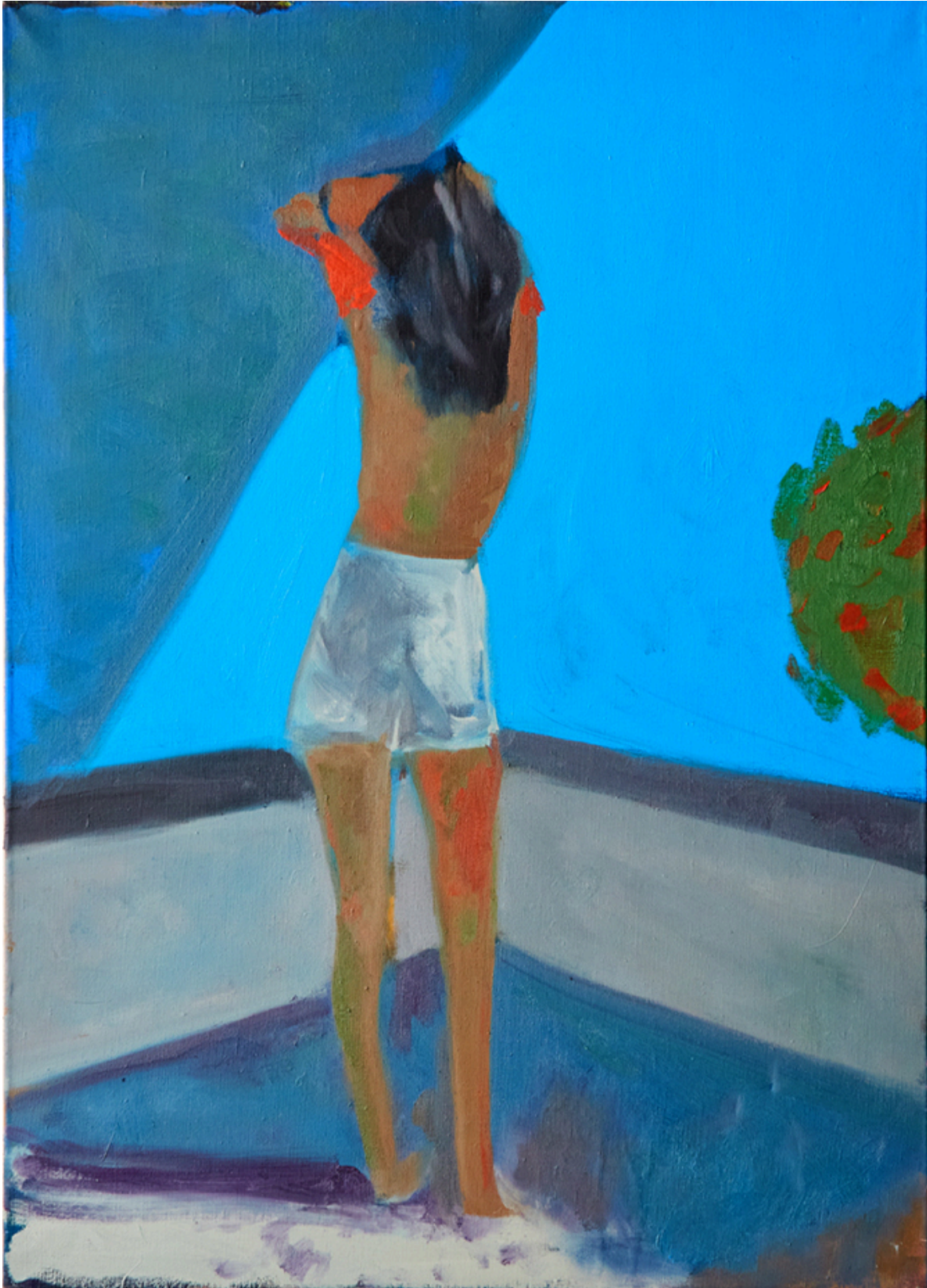
© Jonathan Schofield, The Changeling . Courtesy Columbia Road Gallery.

To explore the world of Columbia Road Gallery and its artists, visit columbiaroadgallery.com .