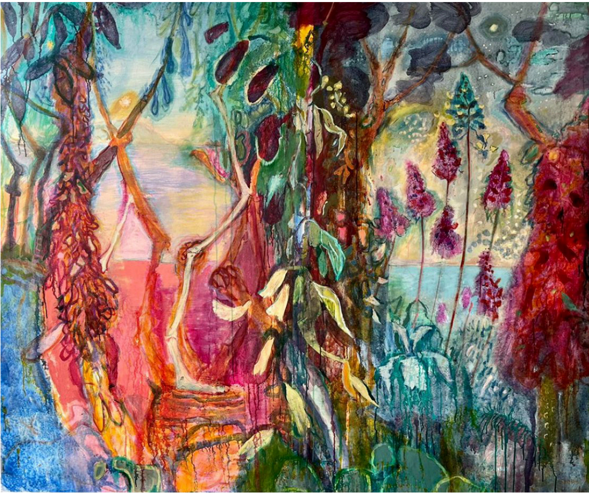
© Lucas Pertile. The Path of the Wandering Gods . Oil, acrylic and charcoal on canvas 70.8 x 50 inches. Courtesy Coral Contemporary Gallery.