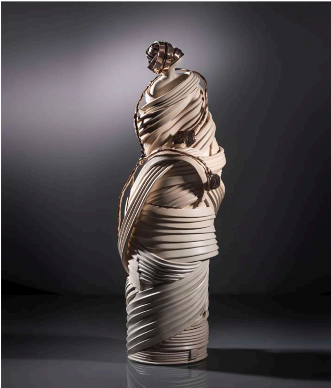
©Tuba Önder Demircioğlu. The Roots Collection, "Yesterday", Artistic Freeforming, Slab Technique, Electric Firing, Bronz Applicata.