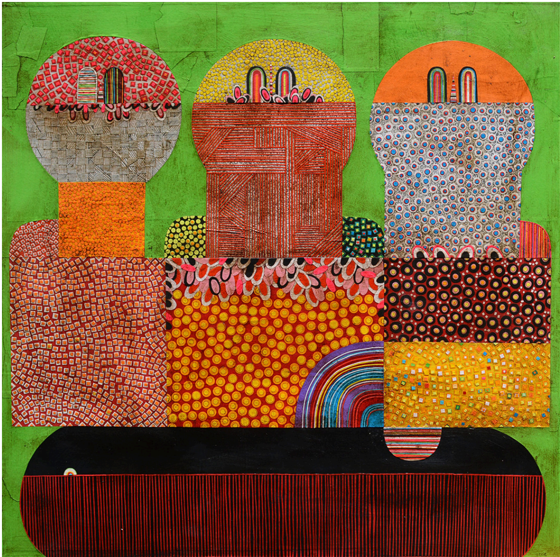
©Gustavo Ortiz (Argentina). Three Archetypes . Mixed Media on Canvas.