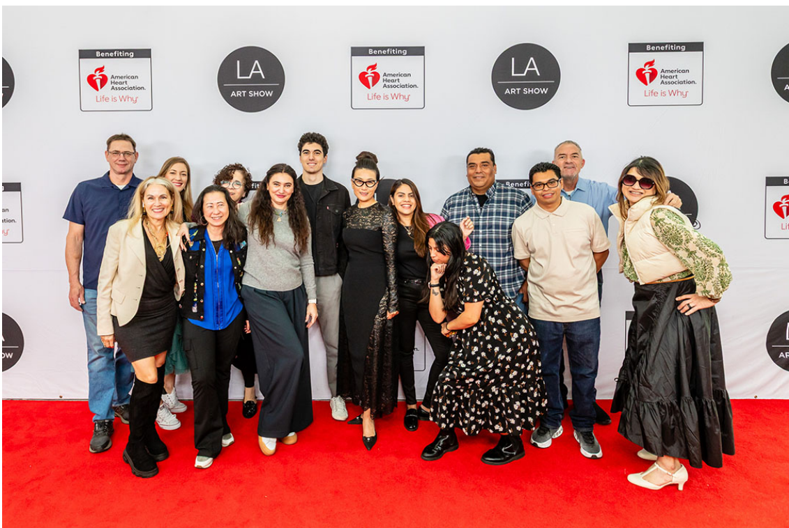
All photos courtesy @birdmanphotos