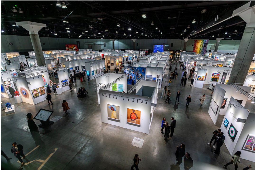
Photo Highlights from LA Art Show 2025

To learn more about the Life is Why™ campaign and other participating companies, please visit https://www.heart.org/en/get-involved/ways-to-give/life-is-why . Connect with the American Heart Association on heart.org , Facebook , Twitter or by calling 1-800-AHA-USA1.