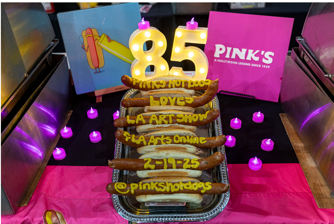
All photos courtesy @birdman and Getty Images.