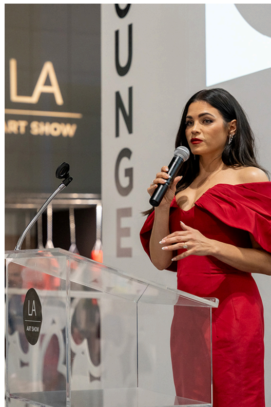
Celebrity host Jenna Dewan addressing the crowd at the opening night event in the VIP lounge.