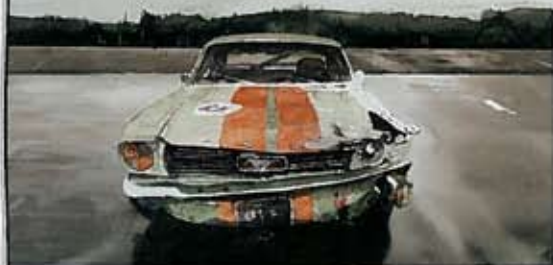
I'm Holding On for that Teenage Feeling